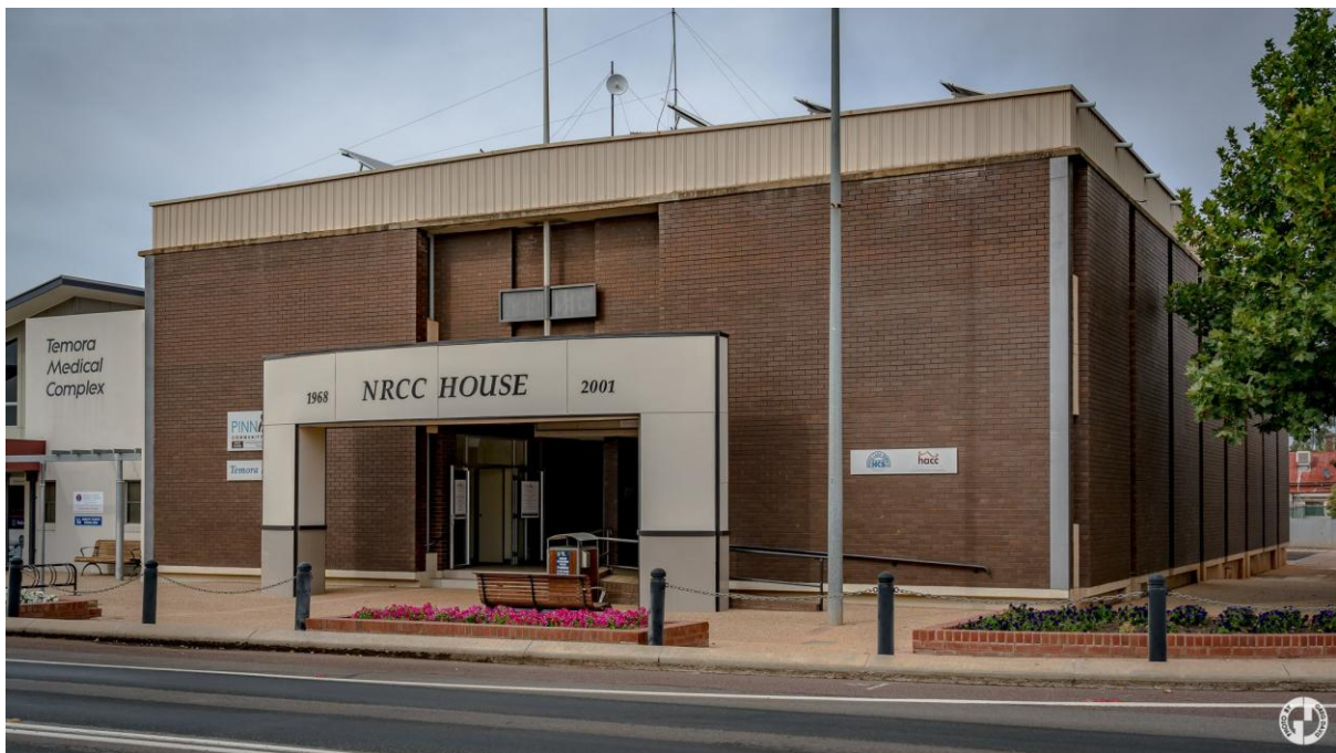
Figure 2 - NRCC House

Together, these elements position the Temora Medical Precinct—and NRCC House specifically—as a highly strategic and collaborative location for allied health, specialist, and complementary service providers.