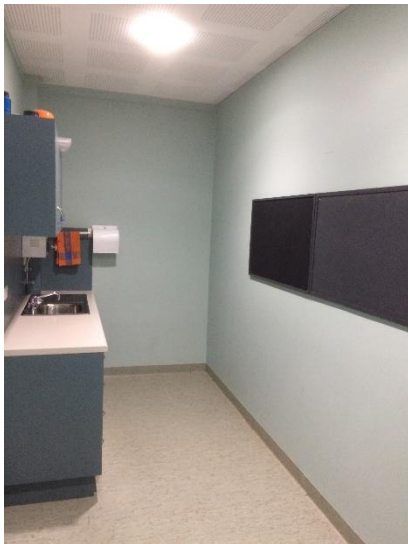
Figure 4 - Staff Room / Kitchenette