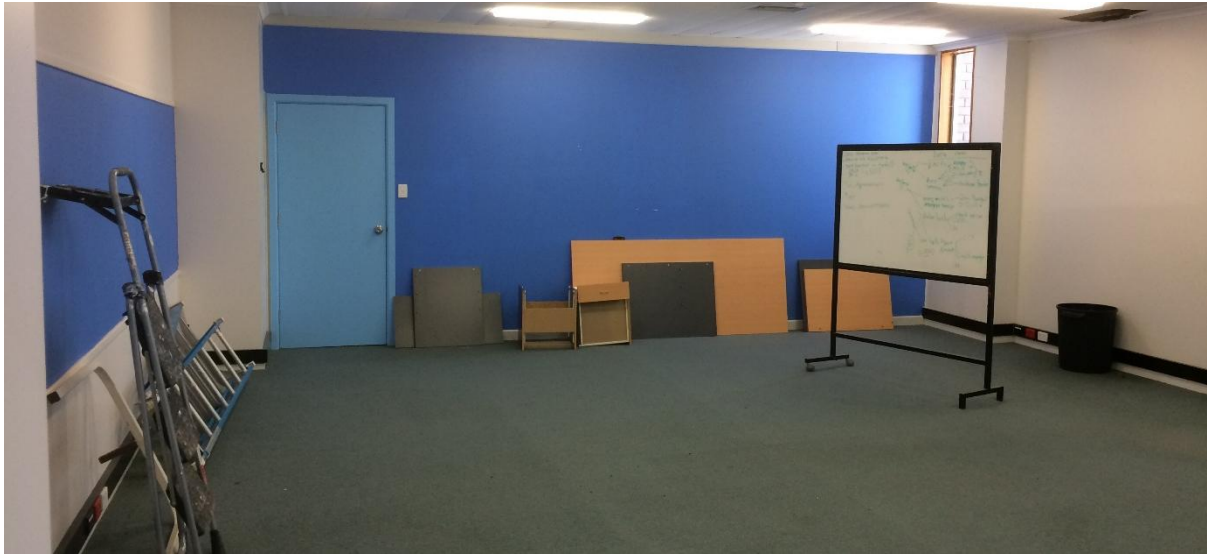
Figure 3 - Room 2