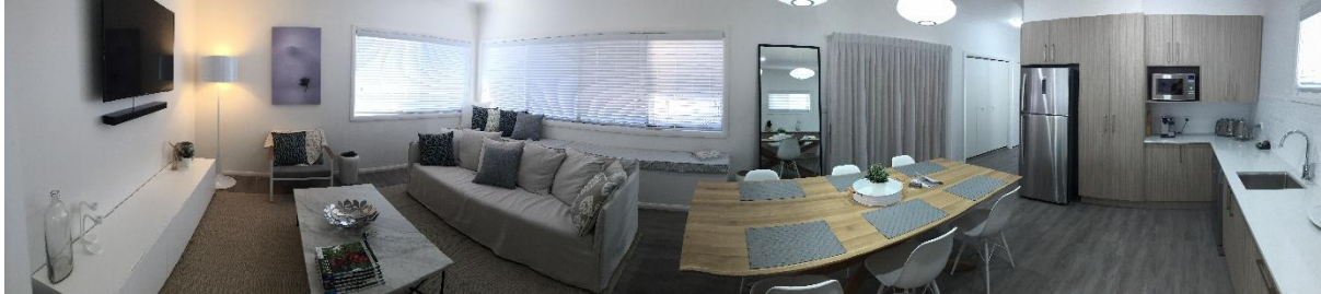
Figure 6 - Temora Medical Accommodation Units - Interior