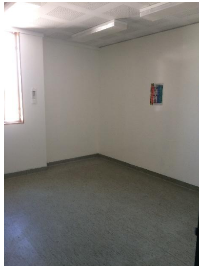
Figure 5 - Room 3