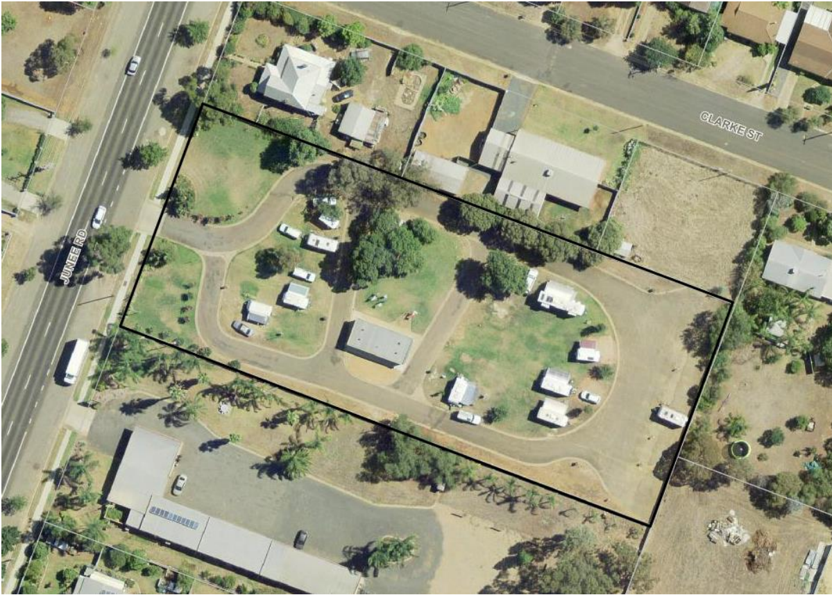
Figure 2: Aerial image of the Temora Caravan Park