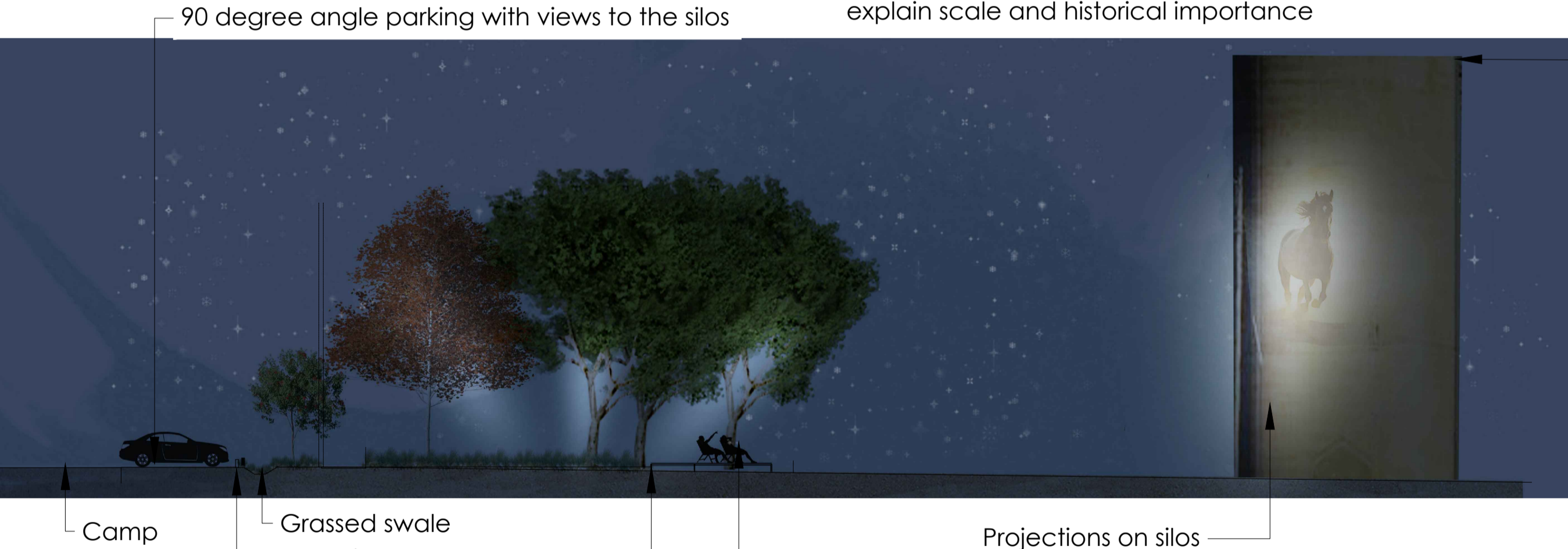
SECTION D-D 1:200 Refer to Goods Siding No4 L03 for location