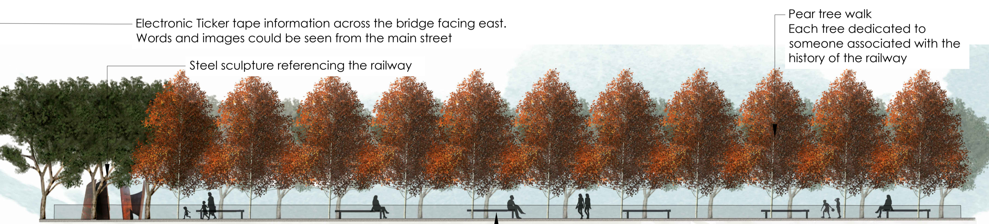
SECTION E-E 1:200 Refer to Goods Siding No4 L03 for location