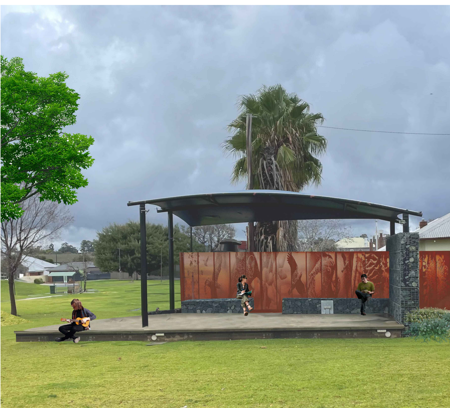
View 5 The Stage Refer to L08 for expanded view Image of screen by Rick Vermey